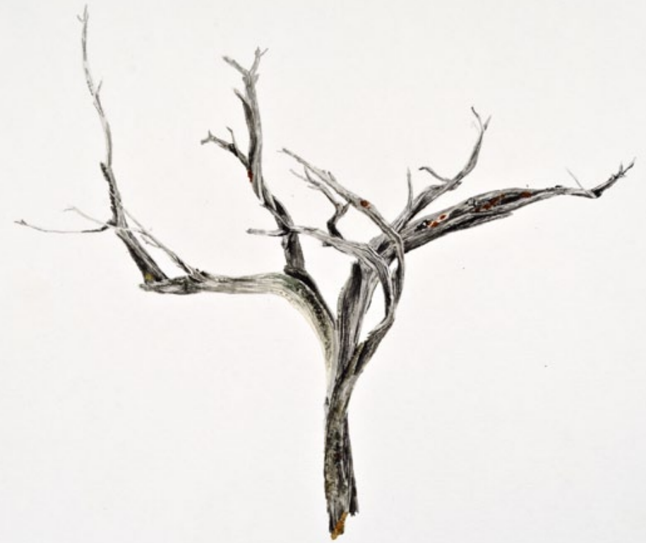
Artemisia tridentata I , 2016

seeing was hard for me to grasp. Then, I was so taken by the twisted forms of juniper trees. On walks, I discovered that the dead branches of sagebrush took very similar forms. I collected branches and began painting them in watercolor: still life studies, without any background. I wanted the branches to appear to be specimens, like insects or birds, being recorded for posterity, the painting preserving a fragile object in time. The branches kept shedding little pieces while I worked, continually decaying.